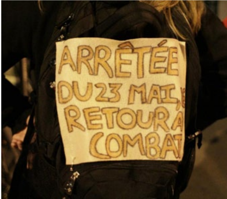
“Arrested on May 23. Now returned to battle.” Photographer unknown.