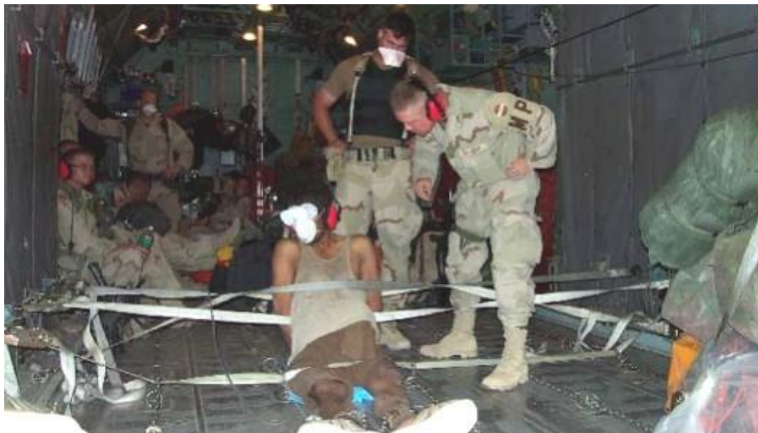
Figure 3: Anonymous Image sent to Mainstream News Organizations in 2002. 6