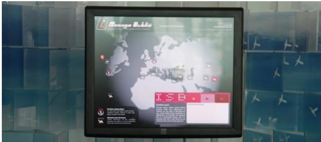
Figure 4: Passage Oublié Touchscreen

Obx developed an interactive world map featuring airports involved in rendition flights. User-entered messages, along with messages gathered during informal interviews, are displayed on flight trajectories. There are three ways to interact with the project. One can look, touch, or contribute to the display.