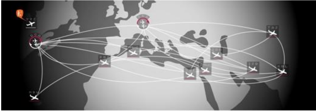
Figure 9: Touching All Icons Triggers A Full But Ephemeral Visualisation of the Rendition Flight Network

The people initially interested in unveiling the dynamics of rendition flights had to tackle a complex puzzle. Over the past six years, they have pulled together the following pieces: