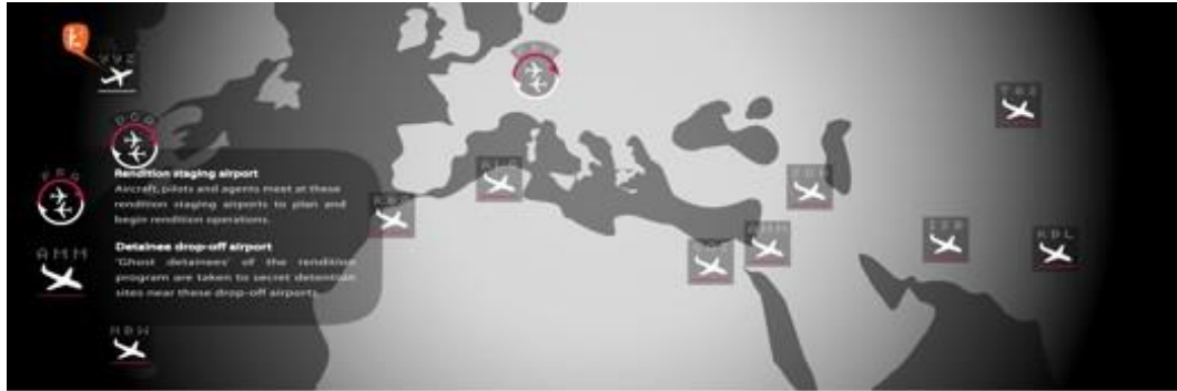
Figure 5: Rendition Airport Icons

The following airports and their codes appear on the Passage Oublié map.