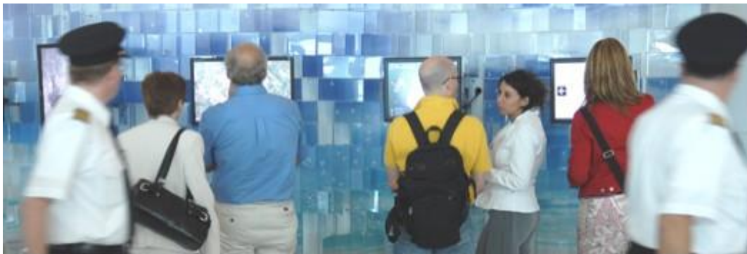
Figure 1: Touchscreen installed at Pearson Airport