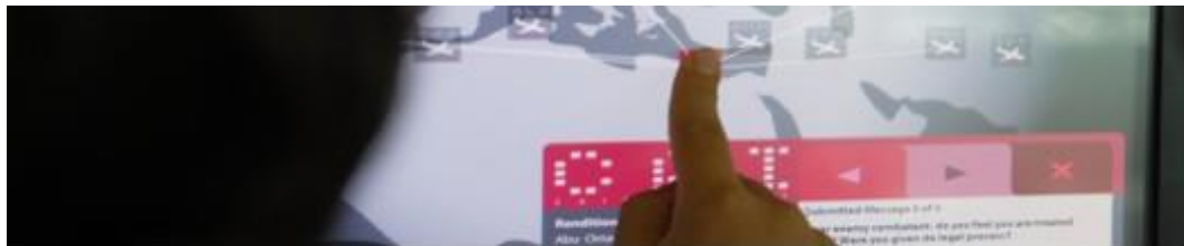
Figure 7: Touching an Icon Shows the Airport's Pop Up and Linkage.

The flight paths featured in Passage Oublié depart and arrive from airports involved in rendition flights. The icons representing these airports are interactive: when a viewer in front of the display touches an airport icon, a pop-up appears. Each airport has a different pop-up featuring tailored content (Figure 9). The pop-up is separated in two segments; one is information about rendition and the other is messages sent by our users.