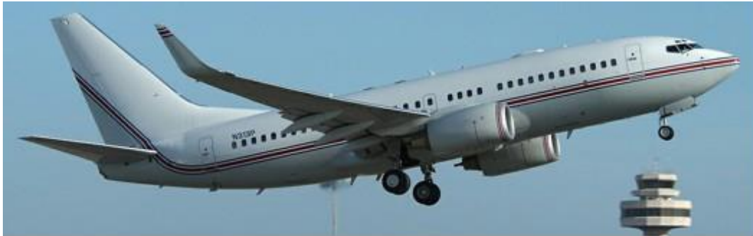
Figure 2: Aircraft N313P of Premier Executive Transport Services. Nicknamed Guantánamo Express.

used for an array of tasks ranging from food drop, ammunition refill to commando missions, kidnapping, personnel rescue, transport of civilians, spies and diplomats. The disguised charter flights transit in regular airports incognito, allowing the CIA to escape public scrutiny and ignore the laws of war.