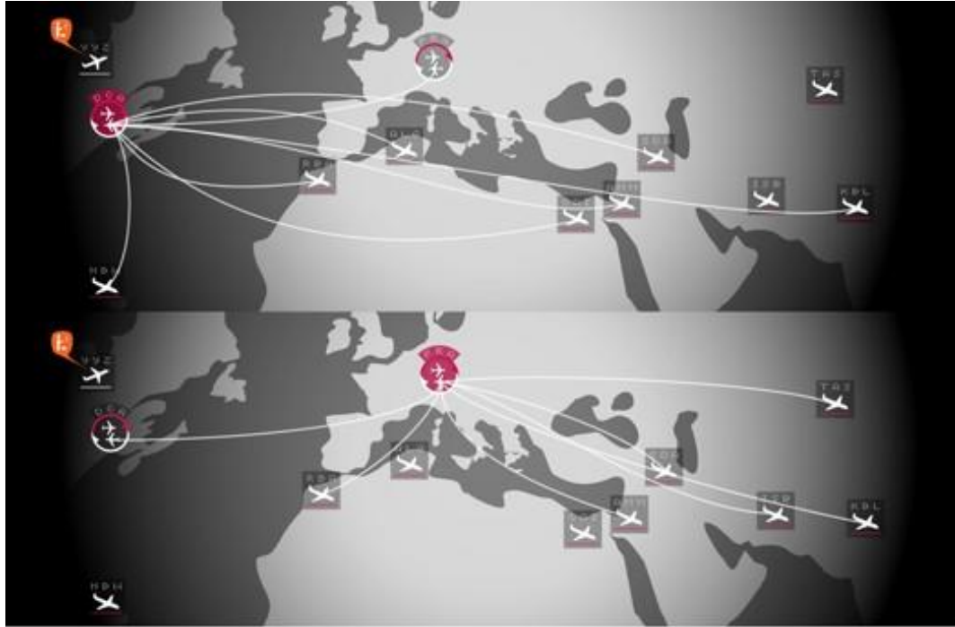
Figure 6: Flight Paths Depart from Washington (Top) or Frankfurt (Bottom) According to Real-Time Flight Data

Real-time data determines which rendition flight trajectory is recreated. Comparing Toronto-Washington and Toronto-Frankfurt flights, Passage Oublié determines where messages take off. If the next flight leaves for Washington, then messages on our display will leave from the Washington airport icon. Inversely if the next flight leaves for Frankfurt, then messages will leave from the Frankfurt airport. Schedules of ‘innocent flights trigger rendition flight path visualizations to emphasize that rendition flights operate under the guise of regular passenger or cargo flights, carried on leased private jets that fill the same flight path requests and frequent the same airports we do.