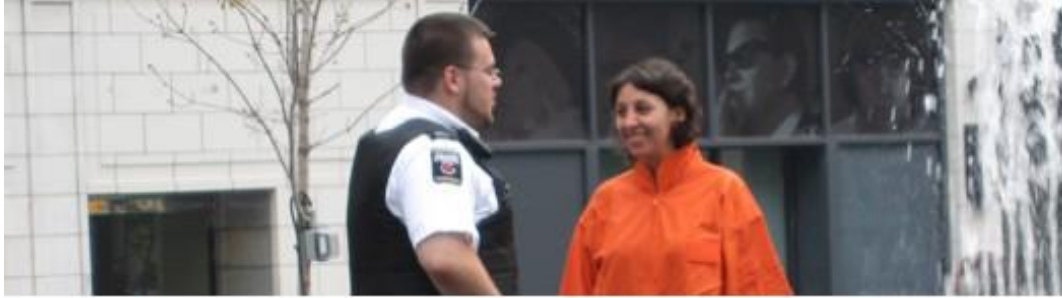
Figure 11: Performing Interviews at Dundas Square, Toronto