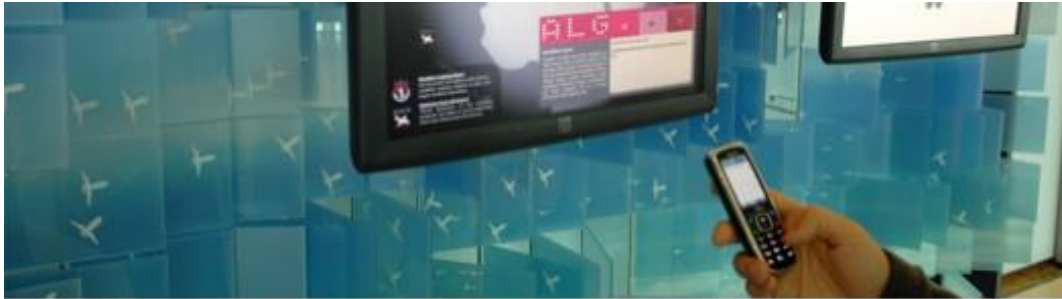
Figure 10: Sending a Text Contribution to the Display Via Text Messaging

Ask yourself whose “rendition flight” was worse – the terrorists’ who end up in Guantánamo, or the civilians’, who jumped out of windows to escape the collapsing World Trade Center.